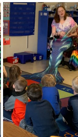
We had a wonderful time at Mountain View Elementary School sharing our Love of Reading for their Community Readers event! It's not every day a Mermaid swims in to share her favorite stories, after all!