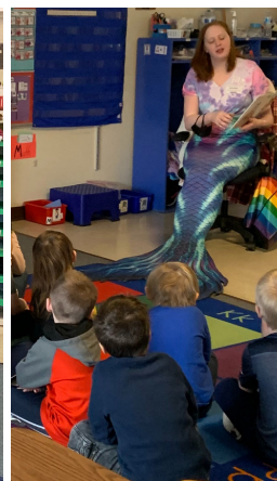
We had a wonderful time at Mountain View Elementary School sharing our Love of Reading for their Community Readers event! It's not every day a Mermaid swims in to share her favorite stories, after all!