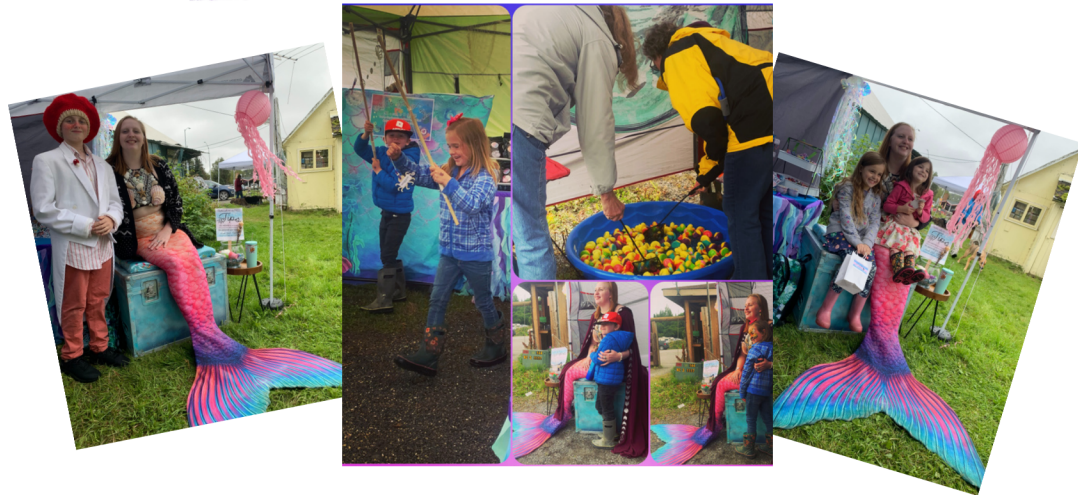
Fun at the Fair and the Fall Fungi Festival!