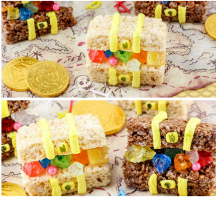
Pirate Treasure Chests