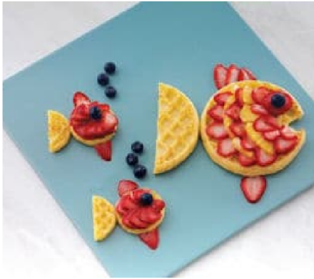
Fish Face Waffles